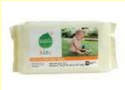
Baby Wipes Refills